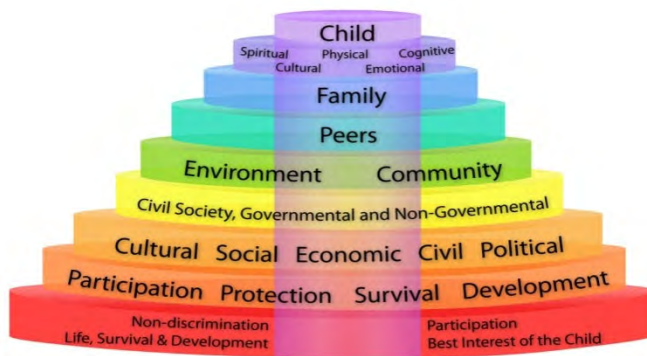
International Institute for Child Rights and Development, Victoria University, Canada